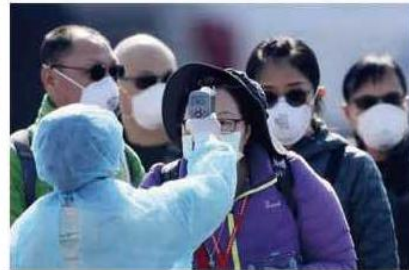
High Volume of Management